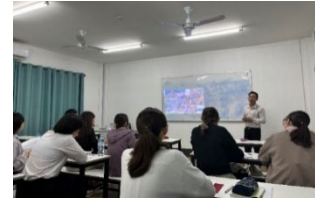
Laos Short Visit (10 first-year Lao Language major students participated)