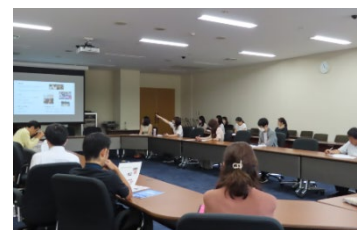
Staff presenting overseas training reports

11 foreign faculty members, one Japanese faculty member who has a degree from a foreign university, and four faculty members who have at least one year of teaching or research experience abroad were hired. 76.2% of newly hired faculty members in FY2023 were foreign faculty members. Education and research has been diversified by providing a wide range of lesson formats and by concluding agreements with universities around the world. In addition to accepting five short-term foreign researchers through a cross-appointment system, agreements were concluded to accept two faculty members from the National Institute for Japanese Language and Linguistics (NINJAL) and to accept one faculty member from and dispatch one faculty member to Hokkaido University. TOEIC test assistance and on-site training has resumed to internationalize our administrative staff. The percentage of staff members who have achieved TOEIC score targets is increasing every year which is improving our ability to handle international business.