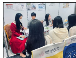
Study Abroad Fair in Korea (100+ students visited the booth)

• A wide range of PR activities were held and attended, such as information sessions organized by our university for current or prospective international graduate and undergraduate students, study abroad fairs (in Korea, etc.), and events organized by universities through the Study in Japan Global Network Project (in Brazil, etc.). The number of participants at these events increased compared to the previous year, as did the number of actual applicants.