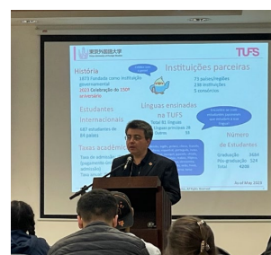
GJO coordinator promoting our university at Rio de Janeiro State University

The monthly activity report for each Global Japan Office was published in Japanese and English to publicize the activities related to Japanese language education and the promotion of Japanese culture at each office, which contributed to supporting students from other universities, high school students hoping to study abroad, and local companies and organizations. The Brazil GJO coordinator made major contributions to opening a Japanese Research Office at Rio de Janeiro State University. In the future, it is expected that research exchanges between Japan and Brazil will become more rapid and active, and that this office will promote more fulfilling Japanese studies and language education in Brazil.