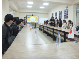
Uzbekistan Study Tour (15 students majoring in various languages participated)