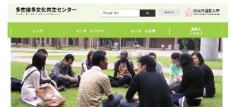
Research project to improve methods for evaluating Japanese language proficiency (commissioned by MEXT)

The “Research project to improve methods for evaluating Japanese language proficiency” was commissioned to improve methods for evaluating Japanese language proficiency by preparing a proficiency criteria (CAN-DO List) that can serve as a base for determining the goals and content of Japanese language instruction, drawing out the “linguistic strengths” of students with foreign roots, and examining evaluation methods.