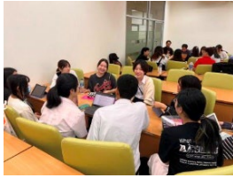
Short-term Study Abroad Program at Chulalongkorn University, Thailand (15 first-year Thai Language major students participated)

A total of 69 Joint Education Programs (JEP) were held both online and in person. A “Designated Part-Time System” was used to allow excellent professors from overseas to give international collaborative education online lectures. Continuing to promote international collaborative education allowed us to improve educational outcomes for students who were unable to travel to or from Japan and to strengthen relationships with faculty members at international partner universities.